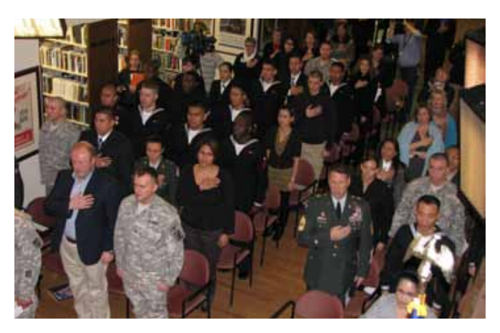
Naturalization ceremony at the Pritzker Military Library in Chicago, IL.

years and reported speaking a language other than English in the home.