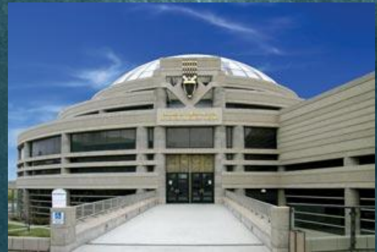
Charles H. Wright Museum of African American History Detroit, Michigan