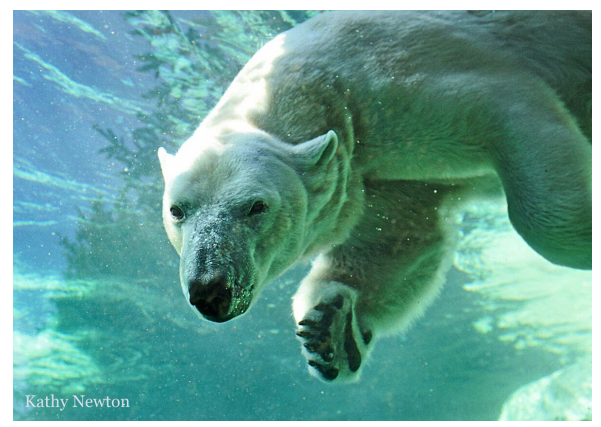
Cincinnati Zoo & Botanical Garden