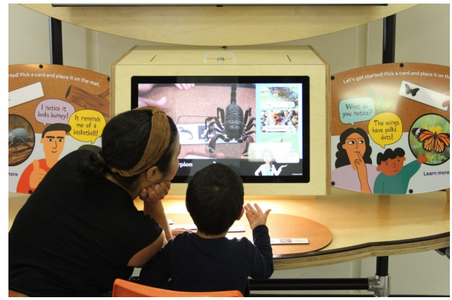
The Lawrence Hall of Science

The Notice of Funding Opportunity offers complete instructions on how to prepare and complete all application components.