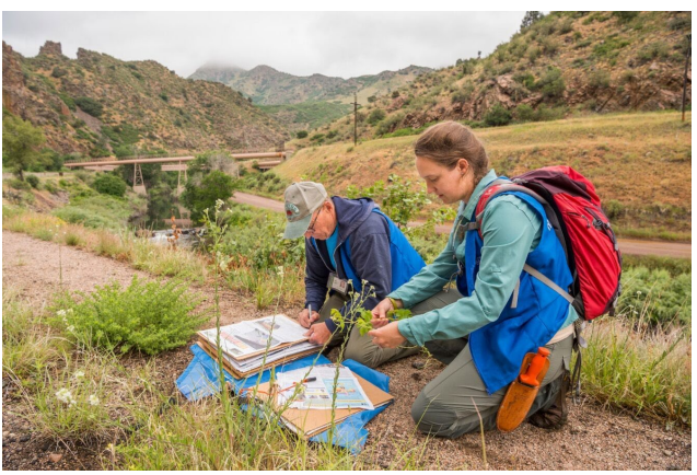
Center for Plant Conservation