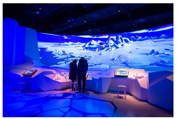
Museum of Science, Boston