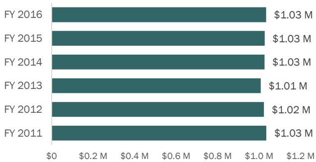
Grants to States Awards (LSTA): FY 2011-2016

The Library Grants to States Program, supported by the Library Services and Technology Act (LSTA), is IMLS's largest program and provides grants to every state using a population-based formula. State Library Administrative Agencies (SLAAs) provide IMLS with a five-year plan and use subawards and statewide projects to improve library services.