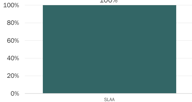
Delaware Grants to States Project Awards by Grantee Library Type: FY 2011-2015

% of projects that include the focus area (Not mutually exclusive, percentage may sum to greater than 100%.)